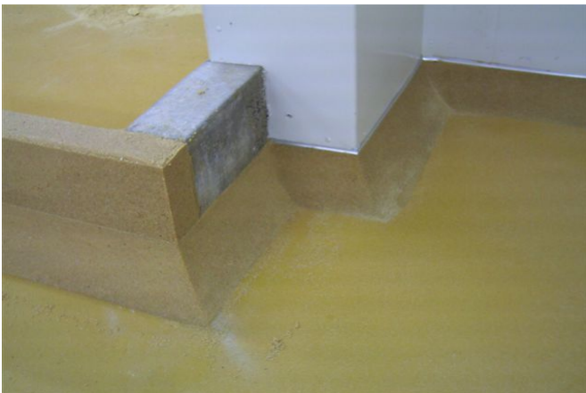
Nuthane Epoxy coves prior to Nuthane topcoat.