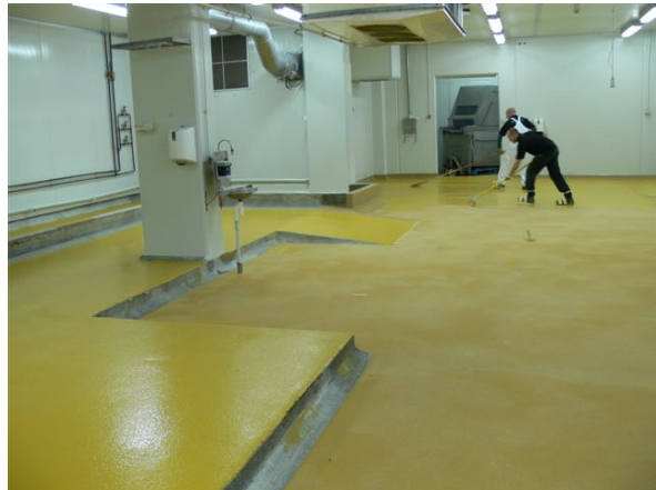
Application of Topcoat to Nuthane base.